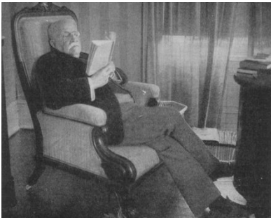
William Dean Howells at 75 (1912)

© 2005, The William Dean Howells Society